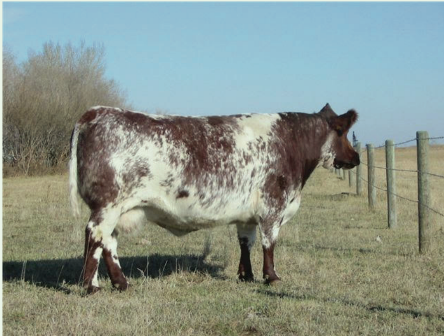
Prairie Lane Sparkle 1K – dam of Stoneyroyd Halcyon Matrix SH4209