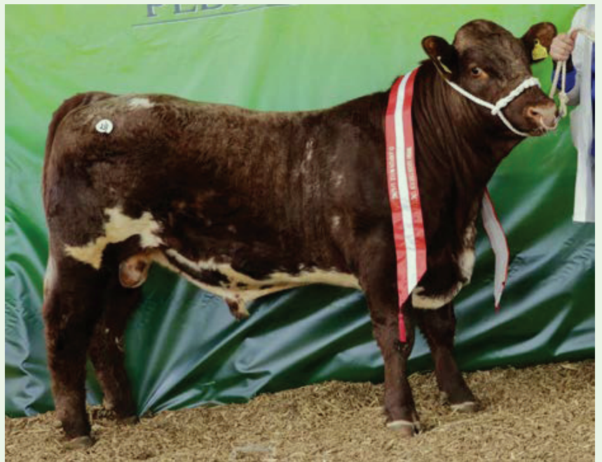
Ballyart Lucky Son - Lavally Parnell, Supreme Champion and Top Priced Bull, Roscommon Premier Sale 2018